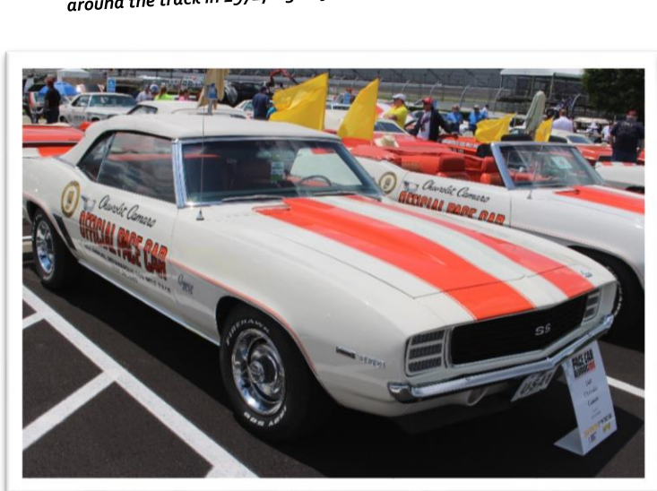
1969 Track/Parade Car #25 and next to it is car #36.