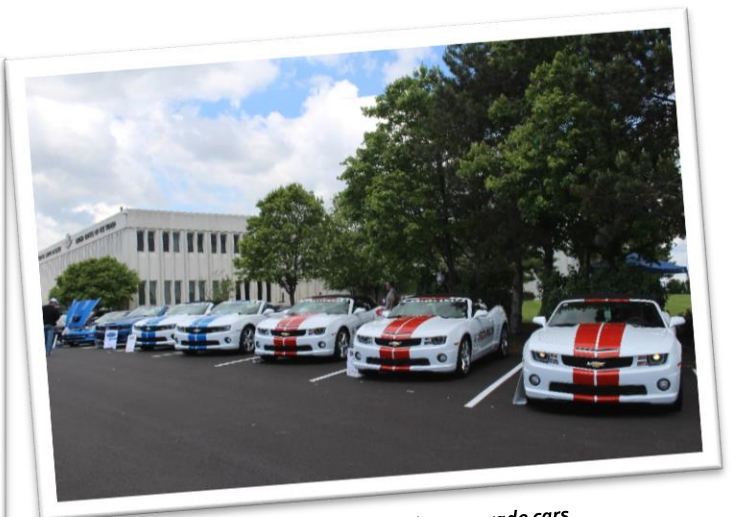
An amazing row of 5 th gen parade cars.